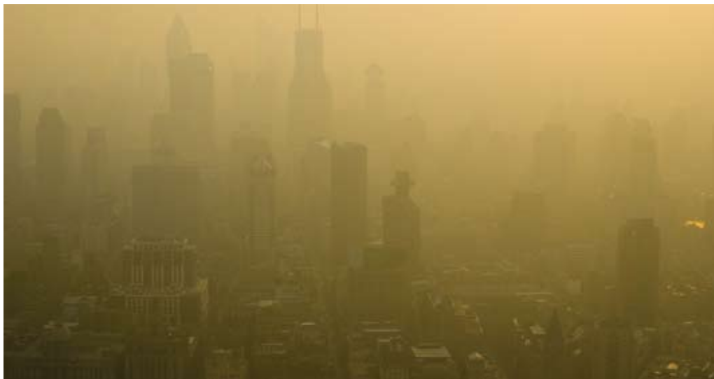
The smoggy late afternoon skies of Shanghai.

Chromium VI is particularly difficult to compare because of the large range of discharge limits specified for each of the U.S. standards to account for the different technologies that may be used. At the high end of permitted discharges for most of the U.S. standards, the current and proposed Chinese standards are more stringent, based on a conversion rate of 6.56m 3 of water per ton, except for the standards for cold forming (cold rolling mills and cold worked pipe and tube). The low end of permitted discharges in the U.S. are more stringent than the current or proposed Chinese standard, except in the case of the 1 day standards for salt bath descaling (oxidizing and reducing) and acid pickling (other than new sources).