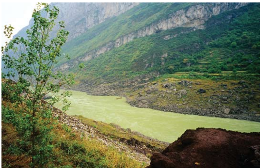
Polluted Wu Jiang River, Chong Qing, China.