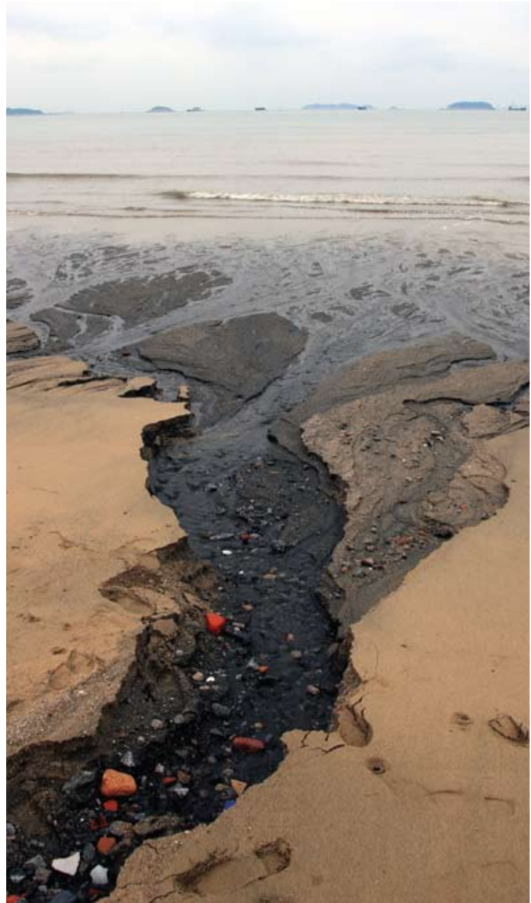
Waste water pollutes a beach in Xiamen.

Successive U.S. laws and regulations have increasingly forced acquisition of advanced pollution emissions control equipment and have deemphasized the costs and economic impacts of acquiring such equipment. This has held true with regard to national standards such as the primary NAAQS, 68 and with respect to specific standards applied to the U.S. steel industry; e.g. the mandated advanced