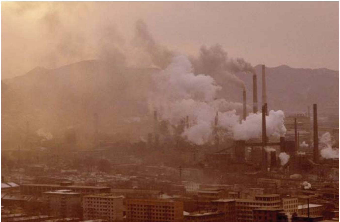
Benxi steelworks and city, Liaoning Province, near Shenyang, China.